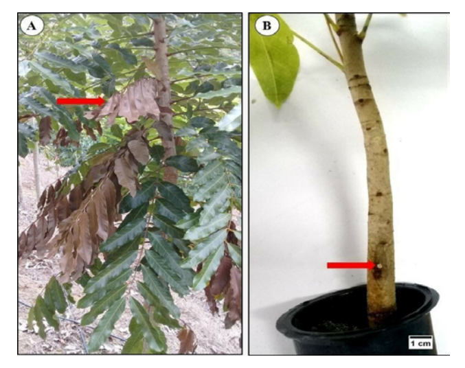
Figure 1. a - Khaya senegalensis plant in the field two years after sowing showing dry leaves due to the petiole borer attack; b - 3-month mahogany seedlings with hole detail (red arrow) caused by petiole perforation.