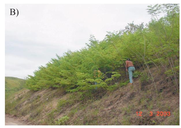
Figure 1 . A) View of the slag heap side before the implantation of the legume trees of experiment 1; B) View of the slag heap side (Experiment 1) 14 months after planting showing Mimosa caesalpiniifolia .

other was 2.5 dm³ of the blast furnace slag + 10 g of FTE Br 12 + 150 g of phosphate of rock (where 1dm³ of cow manure was replaced by the same volume of blast furnace slag). The experimental design was complete blocks. Two factors were evaluated: five doses of hydrogel (0, 3, 6, 9 e 12 g) and 7 levels of water tension, 0.006, 0.01, 0.033, 0.07, 0.1, 0.5 e 1.5 MPa, with four replicates. For this, the mixture was placed in plastic recipients of 1 dm³ and saturated with water. After 30 minutes samples were collected using a volumetric ring, and this was followed by the usual procedure for obtaining values for the construction of a water retention curve (Embrapa, 1997).